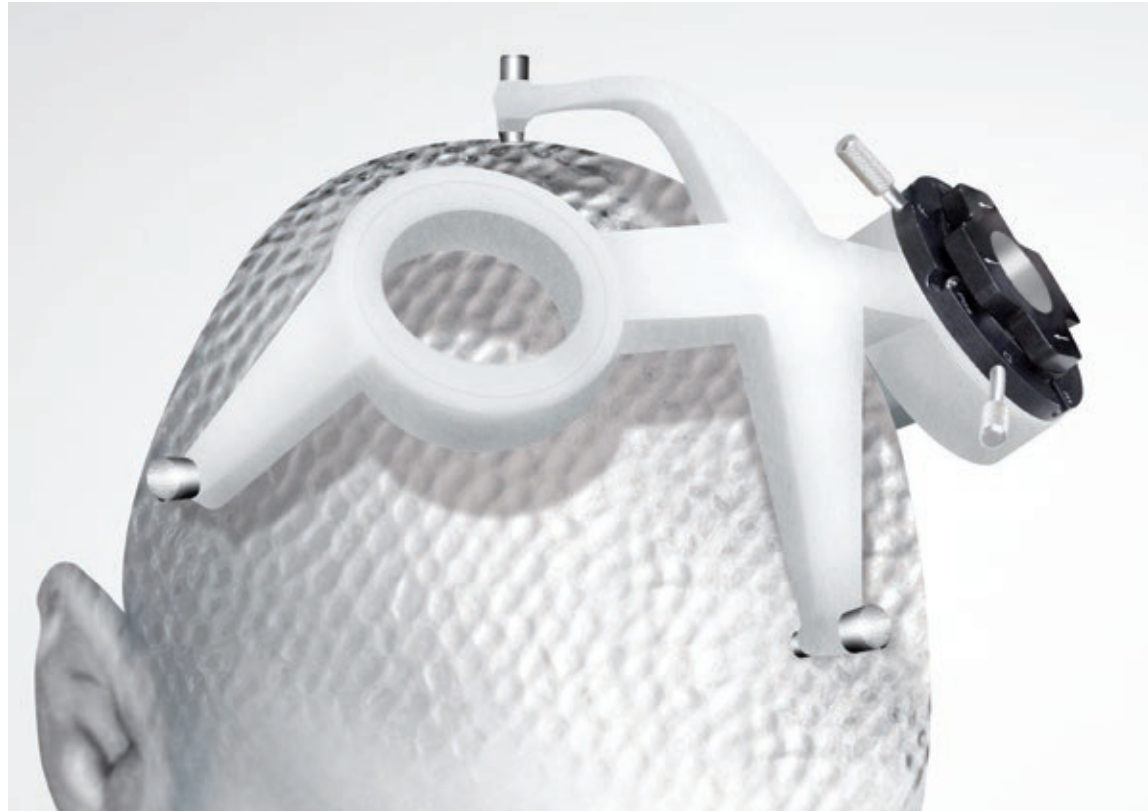
Patient and procedure customized Platform illustrating flexibility of form possible with SLS fabricated Platform.