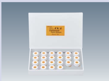
22 colors included

EX-3 UNIVERSAL PASTE OPAQUE BASIC KIT is complete assortment kit of all 22 available shades. Basic shades are based on "nColor" and its handling is very easy. It doesn't matter to use EX-3 PRESS or EX-3 Layering over the metal frameworks.