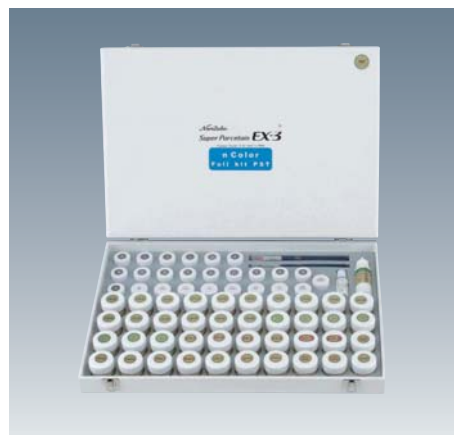
EX-3 nCOLOR FULL KIT PST

The fabrication procedures for NORITAKE SUPER PORCELAIN EX-3 are remarkably easy. Its outstanding features are made possible because of its very fine particle size. NORITAKE SUPER PORCELAIN EX-3 is superior to other dental porcelains because its coefficient of thermal expansion (CTE) remains stable during repeated bakings. Therefore, when making a long span bridge, each unit may be precisely customized with repeated baking of the entire span with minimal risk of cracking. It is compatible with precious, semi-precious, non-precious and silverfree alloys for metal-ceramic prostheses. Its fluorescence is ideal and it is highly resistant to silver-induced greening. This combination of features makes NORITAKE SUPER PORCELAIN EX-3 an ideal choice for porcelain restorations.