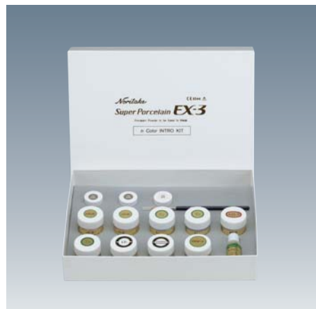
EX-3 nCOLOR INTRO POBA KIT