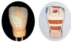
Layering scheme using IS as in the photograph.

Developed in collaboration with the renowned ceramist Mr. Aoshima, INTERNAL STAIN makes the innovative "Internal Staining Technique" practical for everyday laboratory use. The internal staining technique is the best method to replicate many of the most intricate patterns of shade variation found in natural teeth. IS FLUORO is added to the kit.