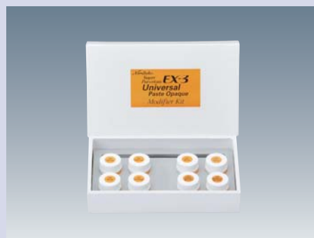
8 colors included

EX-3 UNIVERSAL PASTE OPAQUE MODIFIER KIT may be mixed with EX-3 UNIVERSAL PASTE OPAQUE to customize the shade or may be applied alone for minor modifications.