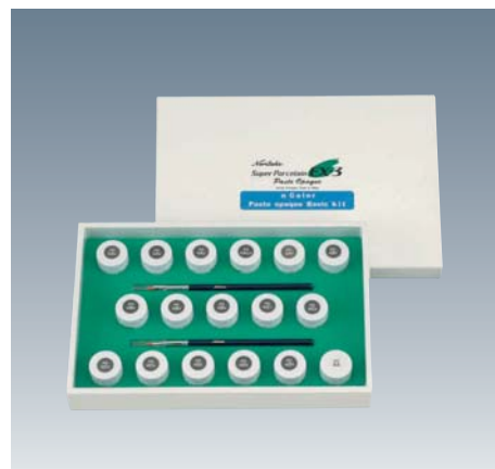
EX-3 PASTE OPAQUE nCOLOR BASIC KIT